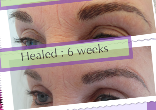
Healed : 6 weeks