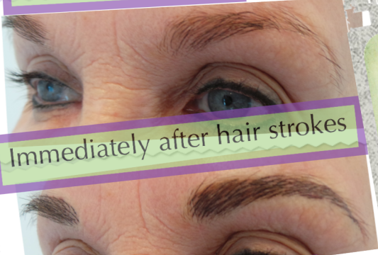
Immediately after hair strokes