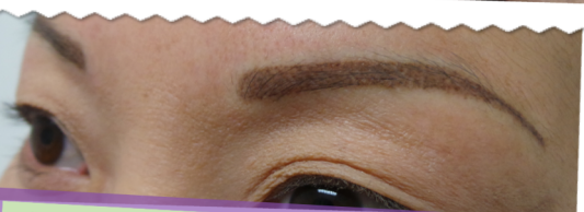
Healed : 3 months, before fine-tuning

Eyebrows are the one thing you can get into shape without exercising