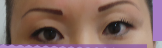
New shape drawn